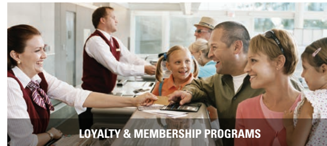
LOYALTY & MEMBERSHIP PROGRAMS