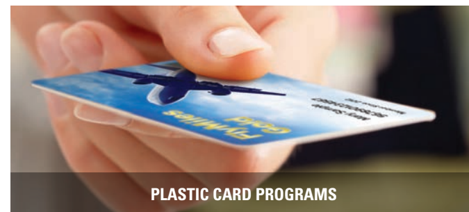
PLASTIC CARD PROGRAMS