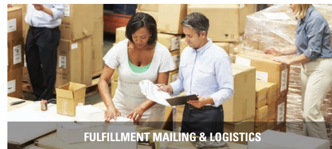
FULFILLMENT MAILING & LOGISTICS